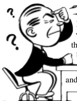
"The limits of memory."