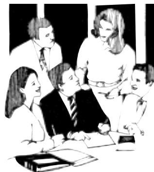
"Alternative Dispute Resolution"

Alternative Dispute Resolution is defined as "... any process designed to resolve a legal dispute ...". A critical aspect of the new rule is that the "... court may order that a case be submitted to an appropriate ADR process ...".